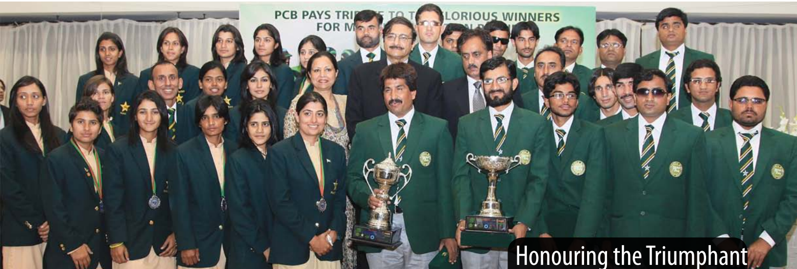
From title page